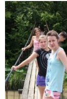
Girls on bridge