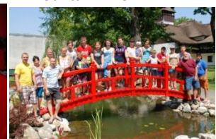
At the water park