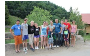
Ready for hiking